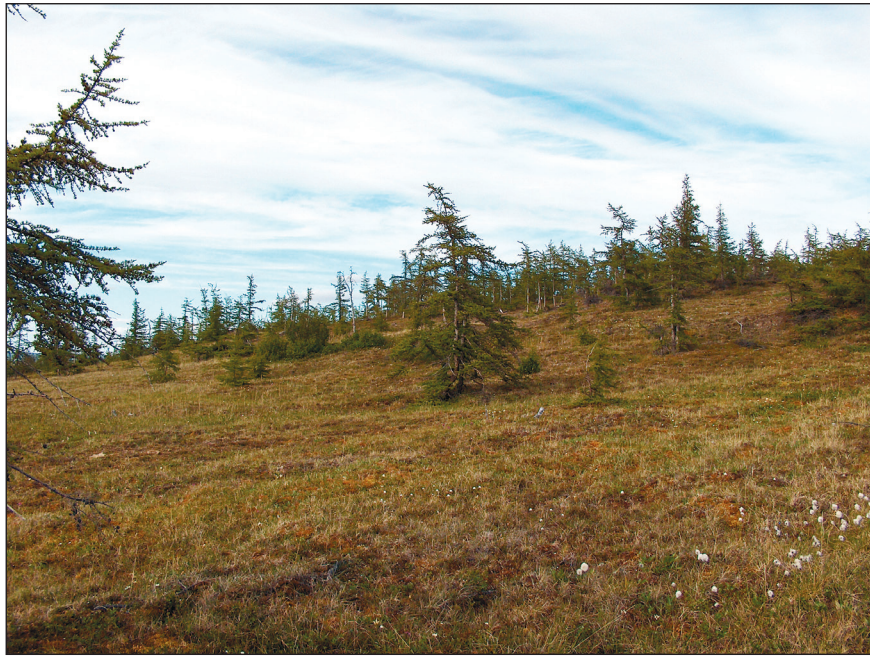
Fig. 2. Significantly damaged larch forest at the upper part of the slope.