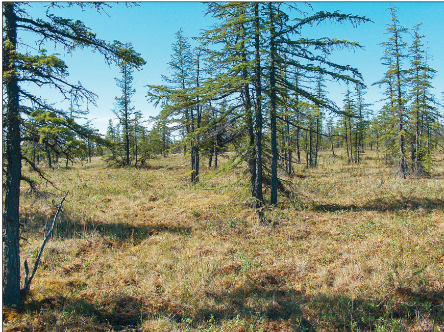
Fig. 3. Relatively healthy larch forest at the plate river terrace (Foto R. A. Ziganshin, 2008).

thick-needled pine may have it. In the locations of the dead forest it is clear that each tree has its own story of the death that is seen in the growth ring and crowns of trees. In one forest stand at the same time one can see not damaged, middle, hard damaged and dead trees of one species in the nearest